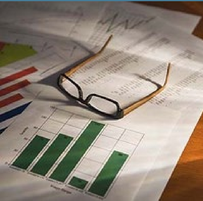
Table of Contents and List of Tables

Over 1,000 corporations in 70 countries are relying on our market intelligence, expert analysis, and strategic insight, critical to the development and implementation of effective business, R&D and marketing programs.